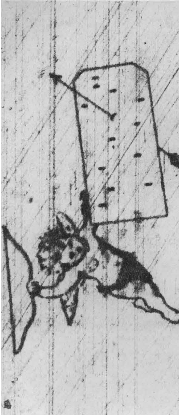
Figure 6. Drawing from advertisement for computer dating, from The Daily Californian , October 18, 1966 (14).