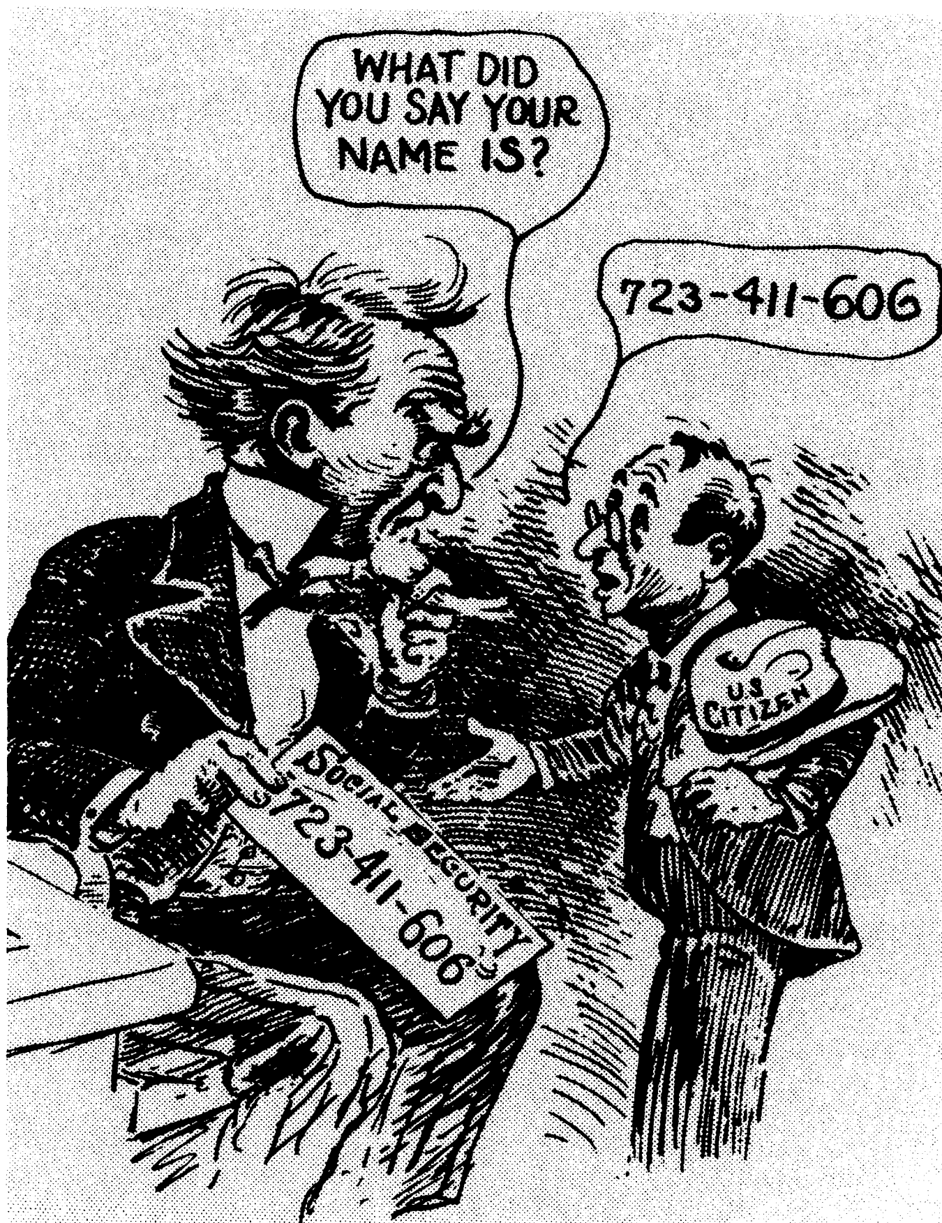
Figure 4. The citizen as number. Editorial cartoon, 1936. Reproduced from Beninger, p. 409.