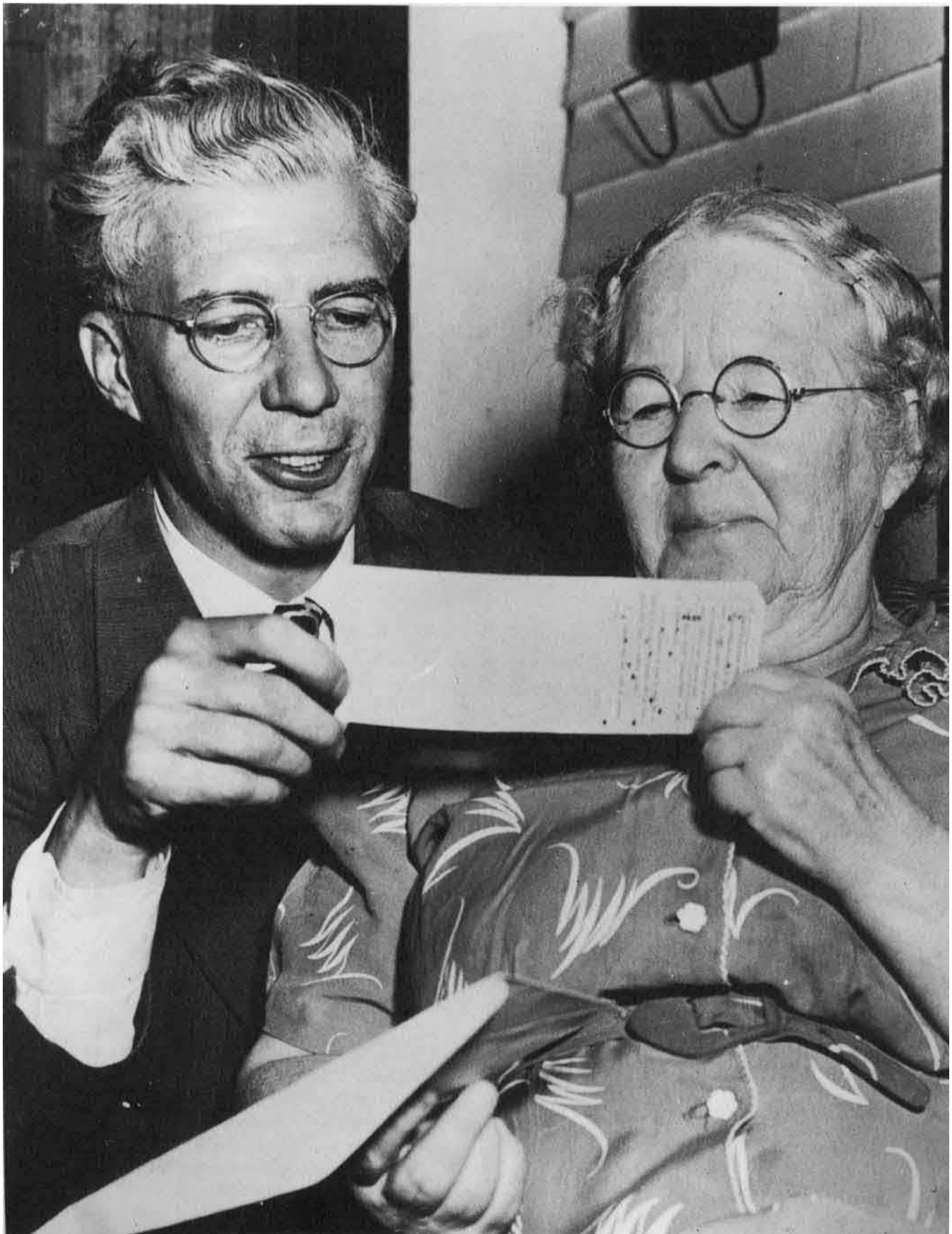
Figure 1. Social Security checks, starting with this first one in 1940, were punch cards.